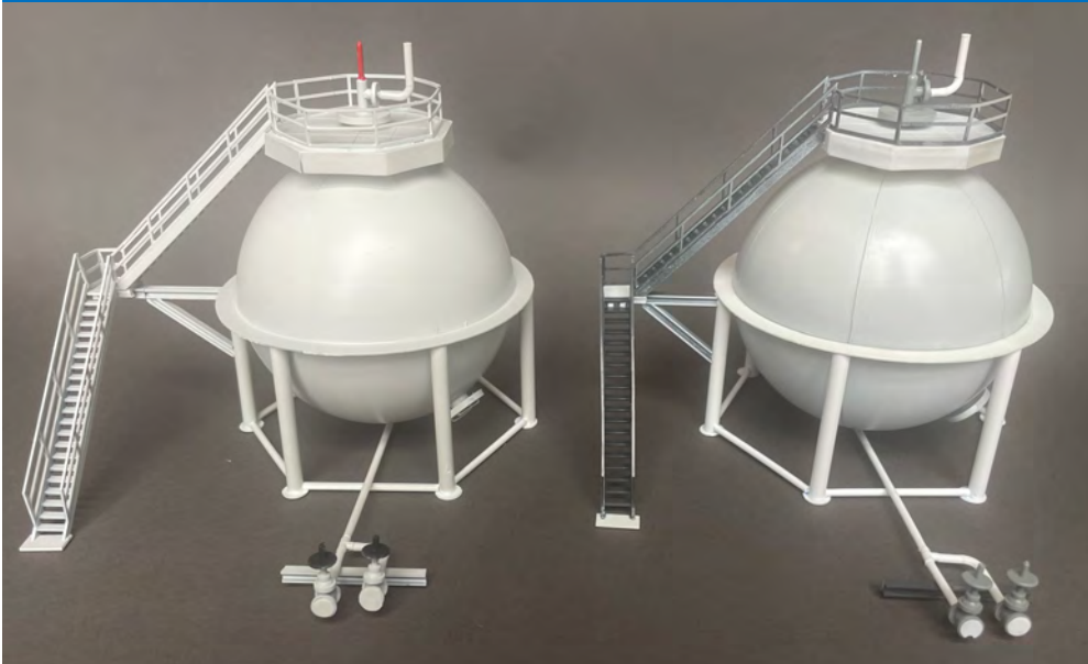
Left one is finished, the right one shows the different components used to build them