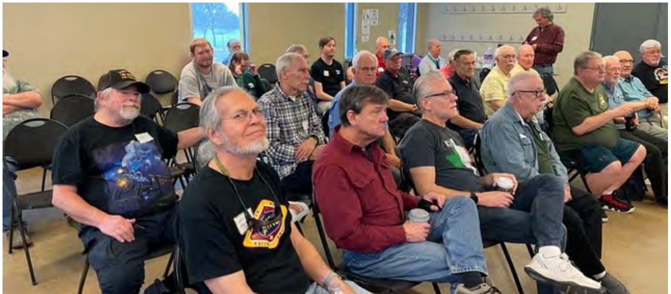
The usual suspects