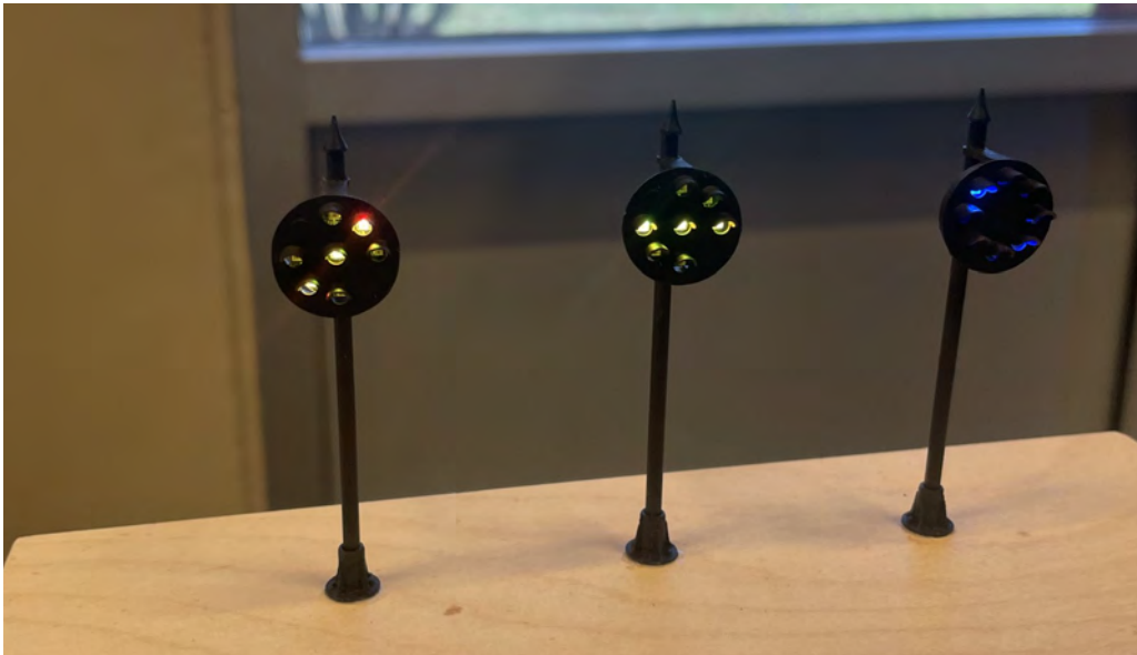
◀ Joel's Position Light driver