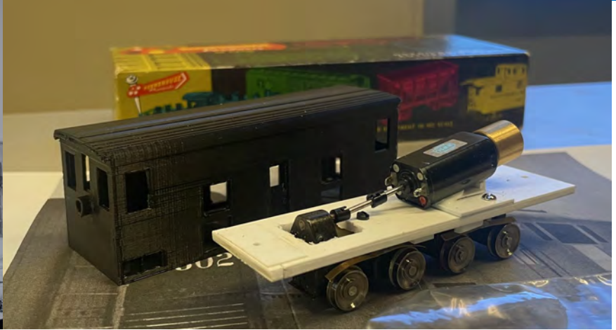
▲ Steve Jakobs in progress Scratcbuilt-3D printed Texas-Mexican Railway 4 axle rigid frame switcher.