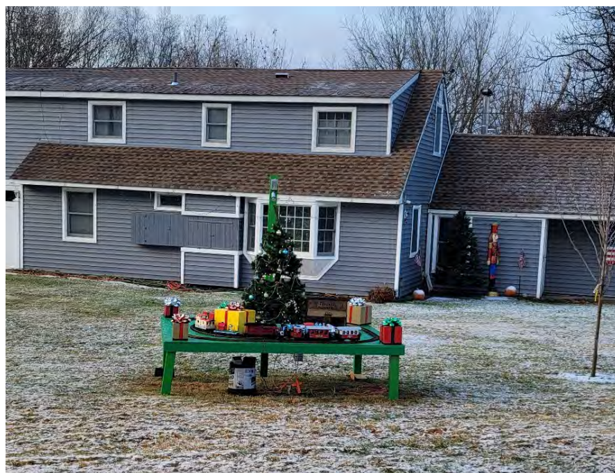
Trains under the tree—Westchester County, NY style!