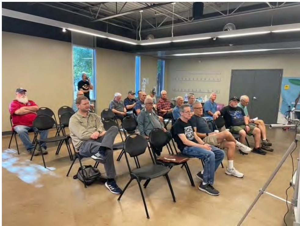
A good turnout of “the usual suspects”