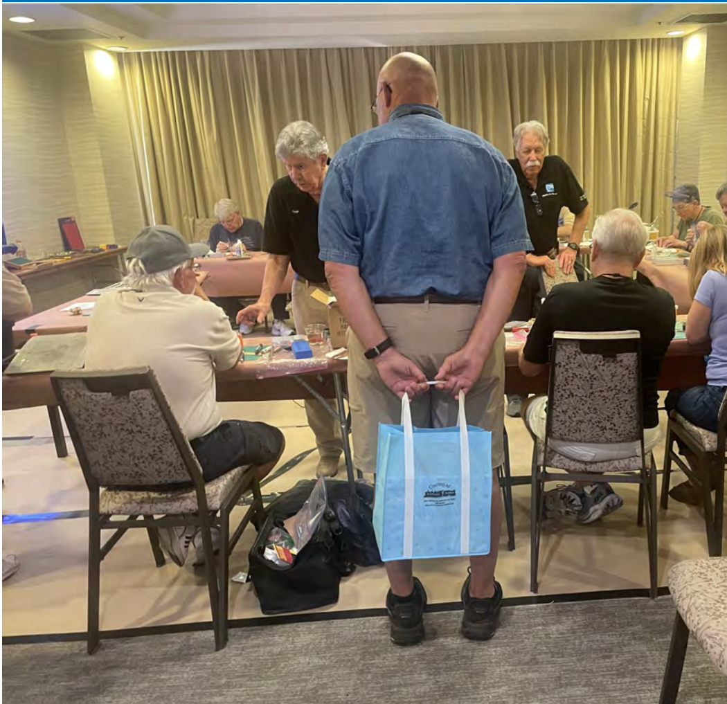
Modeling with the Masters session

NMRA NATIONAL CONVENTION SPECIAL EDITION, Number 1 August 5, 2024