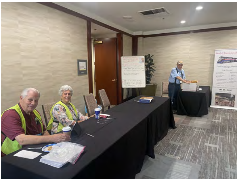
Smiling faces at registration!!

for the ride. After that it was off to bed because Tuesday was starting at 8AM!