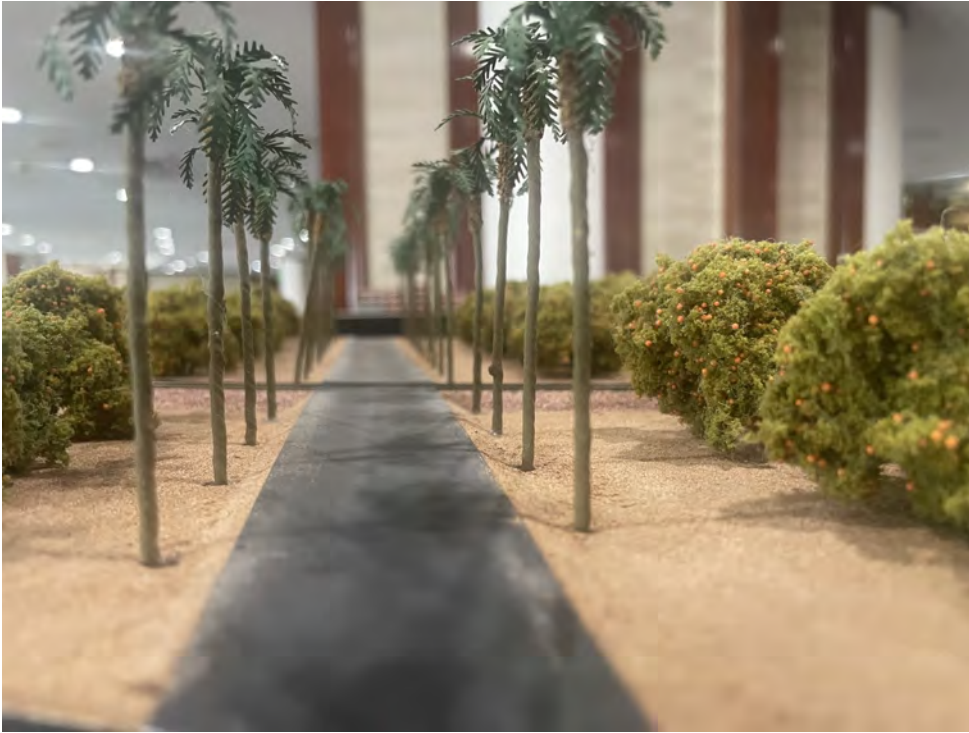
Southern California in N-scale

NMRA NATIONAL CONVENTION SPECIAL EDITION, Number 1 August 5, 2024