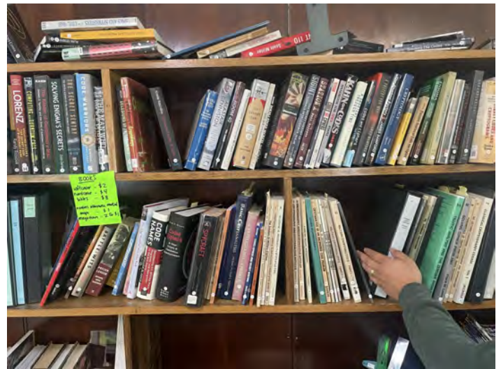
Some of his cryptography books.